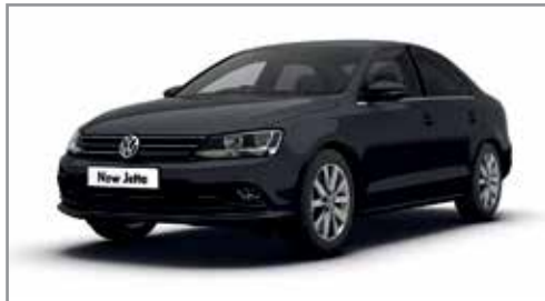
Deep Black Pearl Effect* 2T2T