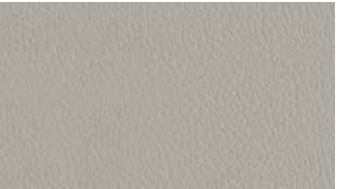
‘Vienna’ leather** Ceramic LQ Optional on Comfortline and Highline models