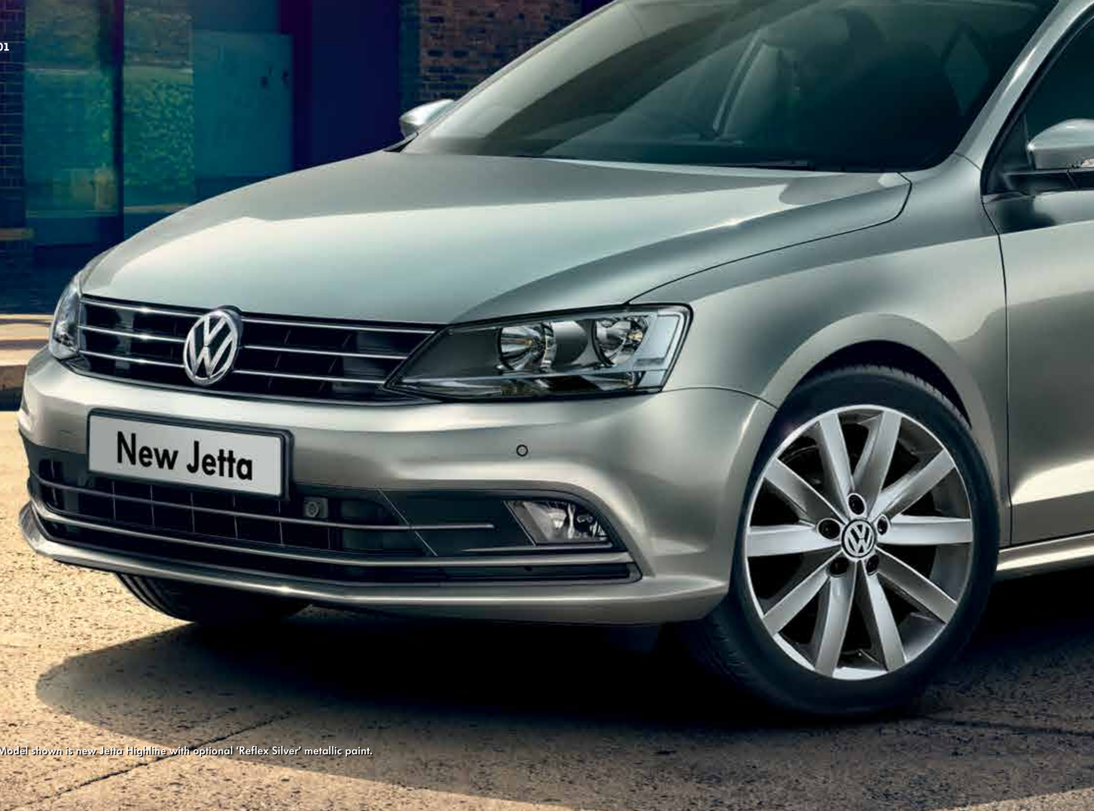
Model shown is new Jetta Highline with optional 'Reflex Silver' metallic paint.