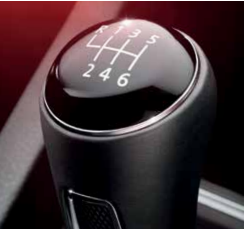
The five and six speed manual gearboxes available for the Trendline transmit power with short, accurate shifts and very smooth handling, making it easy to drive at the right engine speed.