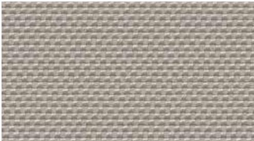
‘Gloss’ cloth Ceramic LQ Standard on Highline models