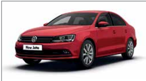
Tornado Red Non-Metallic G2G2