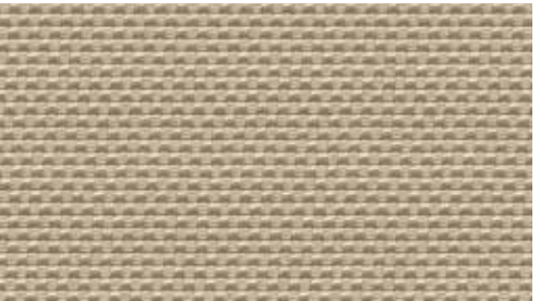
‘Gloss’ cloth Corn Silk Beige JP Standard on Highline models