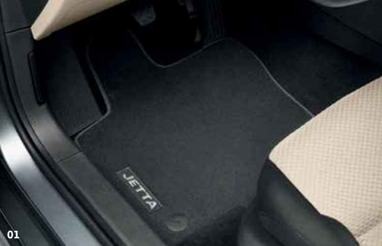
01 Volkswagen Genuine Textile floor mats Protect your interior with these hard-wearing textile mats which fit perfectly to the floor of your vehicle. Made from tightly woven velour with Jetta branding and a practical non-slip backing, the mats are held firmly in place by making use of the attachment points provided on the floor. 5C8 061 270 WGK

If you like the idea of protecting your new Jetta, our range of practical convenience accessories is for you. These products both protect and maintain the value of your new Jetta, but most importantly, they make it a more comfortable drive for you too. From mudflaps to clothes hangers to loadliners, there's something for everyone.