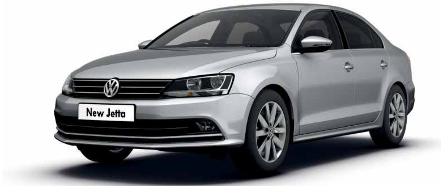
Reflex Silver Metallic* 8E8E