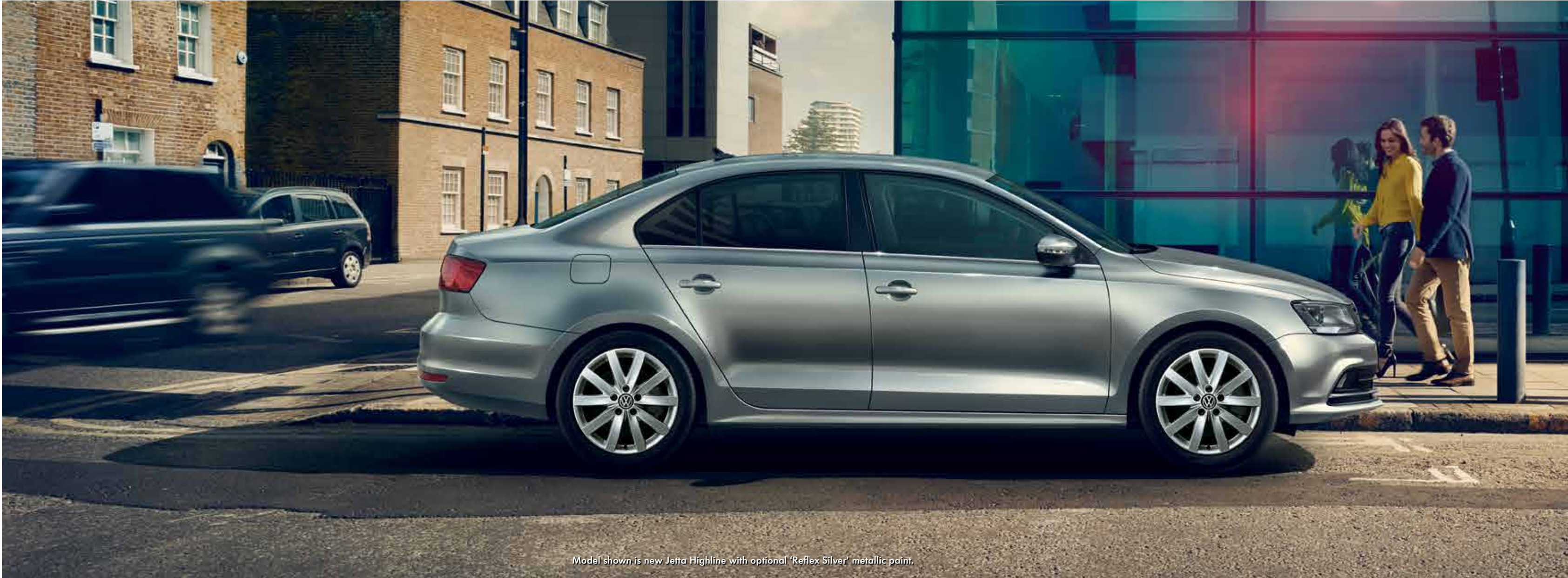
Model shown is new Jetta Highline with optional ‘Reflex Silver’ metallic paint.