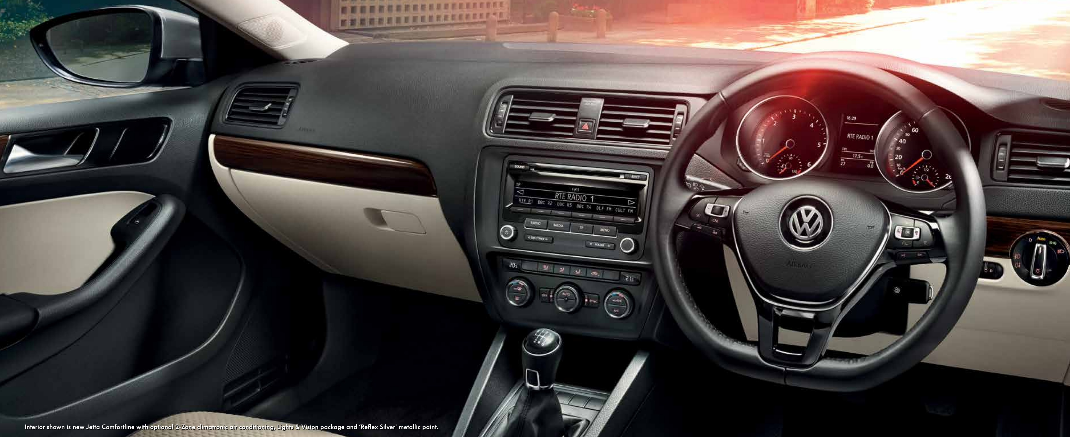
Interior shown is new Jetta Comfortline with optional 2-Zone climatronic air conditioning, Lights & Vision package and 'Reflex Silver' metallic paint.