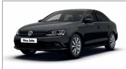
Black Non-Metallic A1A1