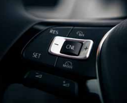
Cruise control can be set at speeds of over 30km/h to maintain a constant speed. Once set to your desired speed, you can focus on the road ahead, creating a more relaxed drive.

Subtle trim elements in the Comfortline provide a touch of elegance and flair with that extra bit of comfort and luxury. With the leather trimmed three-spoke multifunction steering wheel with aluminium decorative inserts providing controls for the RCD 310 radio MP3 player , Bluetooth connectivity for your mobile phone and multifunction display ‘Plus’ as well as cruise control , you can be assured you will arrive at your destination calm and relaxed after every journey. Building over the already well equipped new Trendline, the exterior look of the new Jetta Comfortline is enhanced by the addition of 16 inch ‘Navarra’ alloy wheels and anti-theft wheel bolts, front fog lights with fixed bending light and black radiator grille with chrome mouldings on the fins. While inside, front comfort seats with ‘Sienna’ cloth upholstery including height and lumbar adjustment , ‘Zebrano’ decorative inserts for the dashboard and door trim panel, front centre armrest with storage compartment with two rear air vents , together with a rear centre armrest give both the driver and passengers added comfort. However, the long list of standard equipment doesn’t end there. Choose the new Jetta Comfortline and you will also get load-through provision and a 60:40 split folding rear seat backrest , ideal for transporting long items, storage compartment in the roof console and front seat back storage pockets .