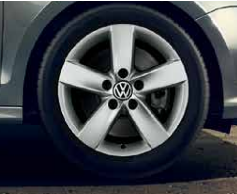
‘Navarra’ 6½ x 16" alloy wheels with 205/55 R16 tyres and anti-theft wheel bolts help create a stylish look for the Jetta Comfortline.