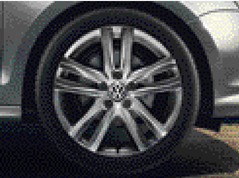
' Lancaster ' 7J x 17" alloy wheels with 225/45 R17 tyres and anti-theft wheel bolts. Optional on Comfortline and Highline models.