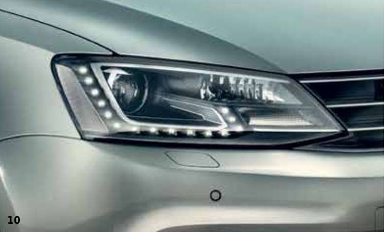
10 Bi-xenon headlights including LED daytime running lights combine dipped and main beams in one integrated unit that flows seamlessly into the bodywork and radiator grille. They also feature static cornering function and dynamic headlight range adjustment that compensate for any change in the incline of the body, due to loading, braking or accelerating. Furthermore, headlight washers help keep them clean in all conditions to ensure your vehicle is visible in any weather. Optional on Comfortline and Highline models.