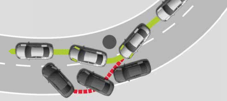
The Electronic Stabilisation Programme (ESP) recognises critical driving situations and reacts in milliseconds by targeting brake and management systems, controlling the speed of individual wheels and helping to bring the vehicle under control. As a result the vehicle achieves maximum directional stability.