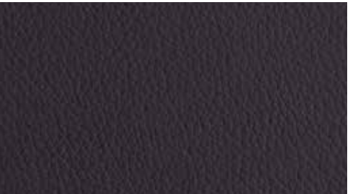
‘Vienna’ leather** Black TW Optional on Comfortline and Highline models