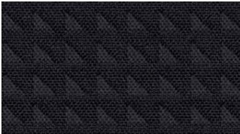
‘Doryc’ cloth Titan Black JM Standard on Trendline models