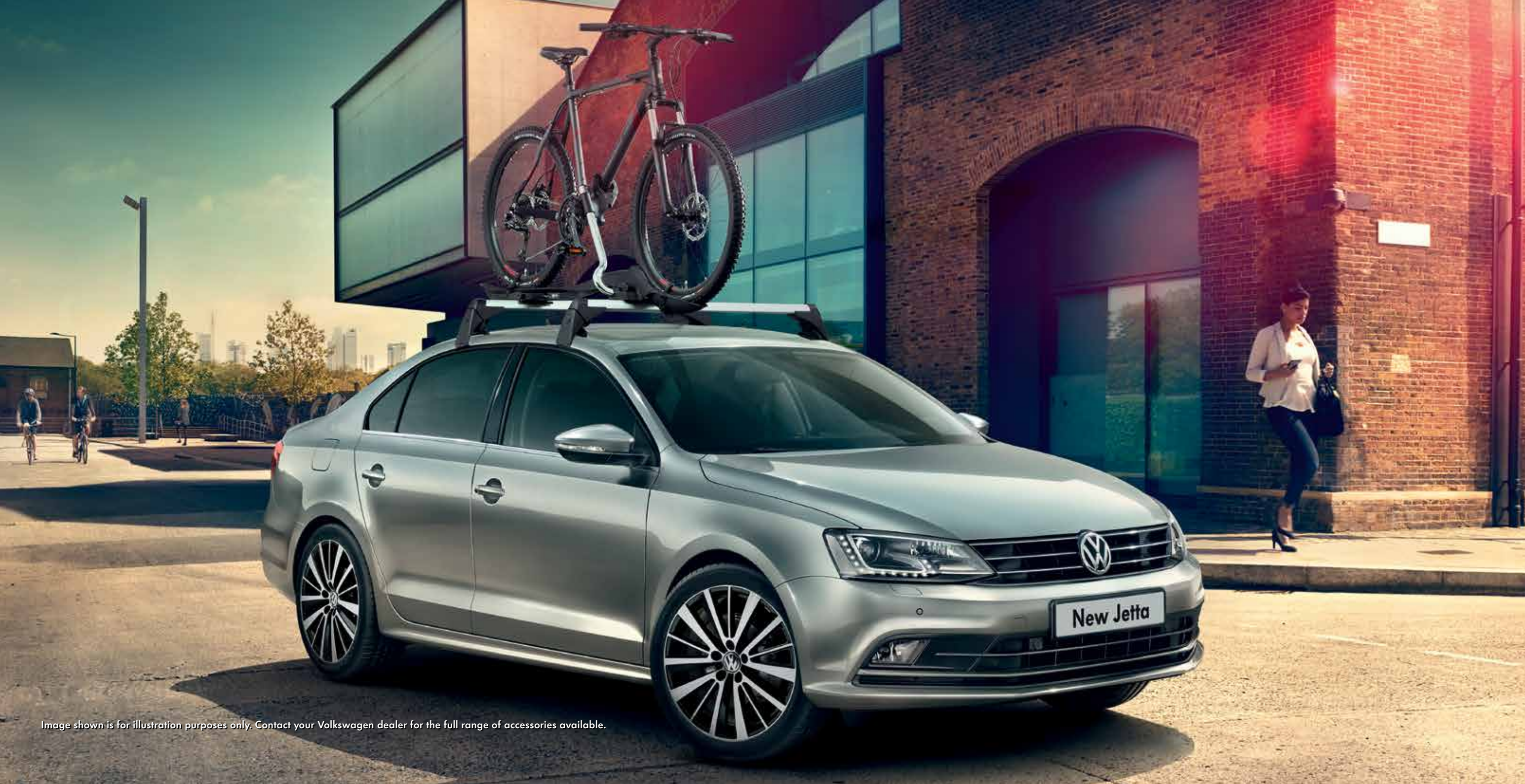
Image shown is for illustration purposes only. Contact your Volkswagen dealer for the full range of accessories available.