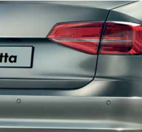
Park Distance Control (PDC) assist in parking manoeuvres by emitting an audible and visual warning, alerting the driver to any obstacles in the way: the closer you are to an obstacle the faster the sound frequency.

An exceptionally high degree of driving comfort combined with impressive power and agility ensures the new Jetta Highline deliver pure driving fun, whichever engine specification you choose. It looks particularly sporty with 17 inch ‘Porto’ alloy wheels complete with sports suspension , decorative chrome strips on the bottom of the side windows , 65% light absorbing rear and rear side windows and electrically folding door mirrors with environmental lighting and kerb-view adjustment . Inside the new Jetta Highline, the vibrant ‘Gloss’ seat upholstery and carpet mats front and rear provide a touch of luxury. Front sports comfort seats with height and lumbar adjustment are fitted as standard and offer the driver and front seat passenger optimum lateral support at all times. The sports look is completed inside with ‘Checker Plate Black’ with chrome decorative inserts in the dash and centre console . To make every journey just that little bit easier and safer, the headlight washer system , Park Distance Control (PDC) , rain sensor and auto dimming interior mirror are all fitted as standard. Finally, automatic headlight activation with separate daytime running lights , ‘leaving home’ and manual ‘coming home’ function light your entry and exit from and to your Jetta in diminished light.