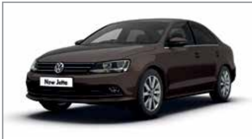
Toffee Brown Metallic* 4Q4Q