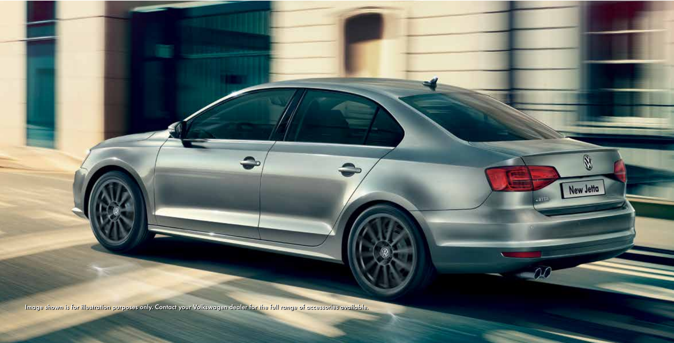
Image shown is for illustration purposes only. Contact your Volkswagen dealer for the full range of accessories available.

Details make all the difference. Add detail that will transform your new Jetta's appearance from sleek to sporty. Your new Jetta already comes with enviable design and solid-build quality. But now you can enhance it further and make a statement with our range of styling accessories.