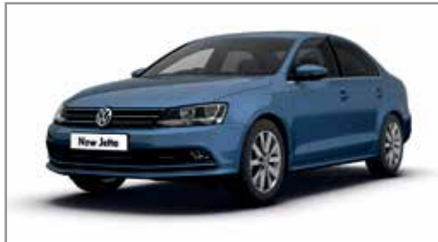
Blue Silk Metallic* 2B2B