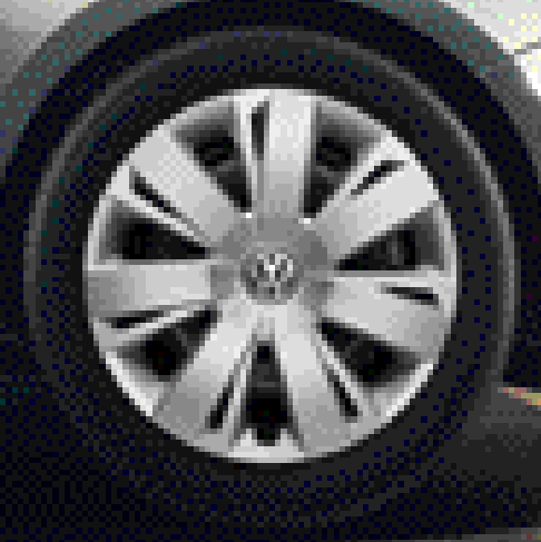
6½ x 16" steel wheels with 205/55 R16 tyres and full size wheel trims give the Trendline an exclusive look.