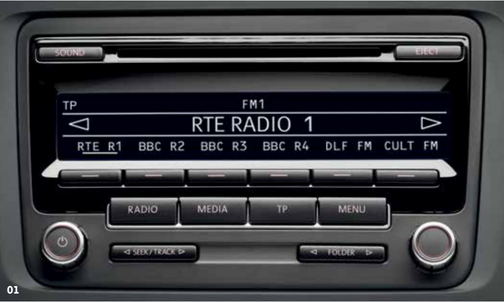
01 The RCD 310 radio system/MP3 compatible CD player provides excellent acoustics via eight speakers with an output of 4 x 20 watts. It also features a Mobile Device Interface AUX-in socket for connection to an external multimedia source, such as an iPod or MP3 player. Standard on all models.