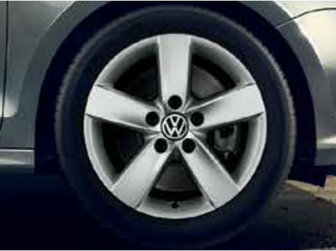
' Navarra ' 6½J x 16" alloy wheels with 205/55 R16 tyres and anti-theft wheel bolts. Standard on Comfortline models.