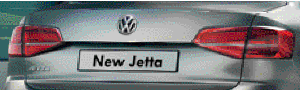
The distinctive redesigned boot lid incorporates an aerodynamically efficient lip which sits above the new rear light clusters and the revised bumper.