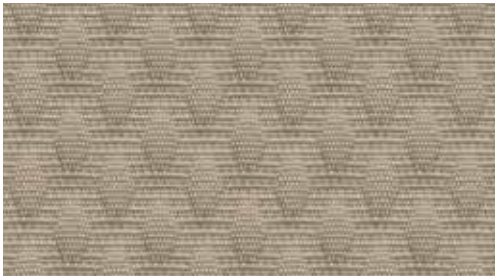
‘Sienna’ cloth Corn Silk Beige JP Standard on Comfortline models