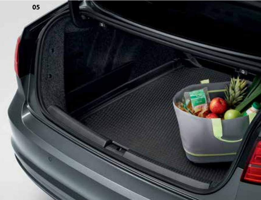
05 Volkswagen Genuine Flexible loadliner This light, flexible and washable custom-made inlay fits perfectly to the vehicle boot contours protecting the boot from moisture and dirt. The moulded inlay prevents movement of goods in the boot. If the boot liner is not required, it can be simply rolled up to save space. 5C6 061 160