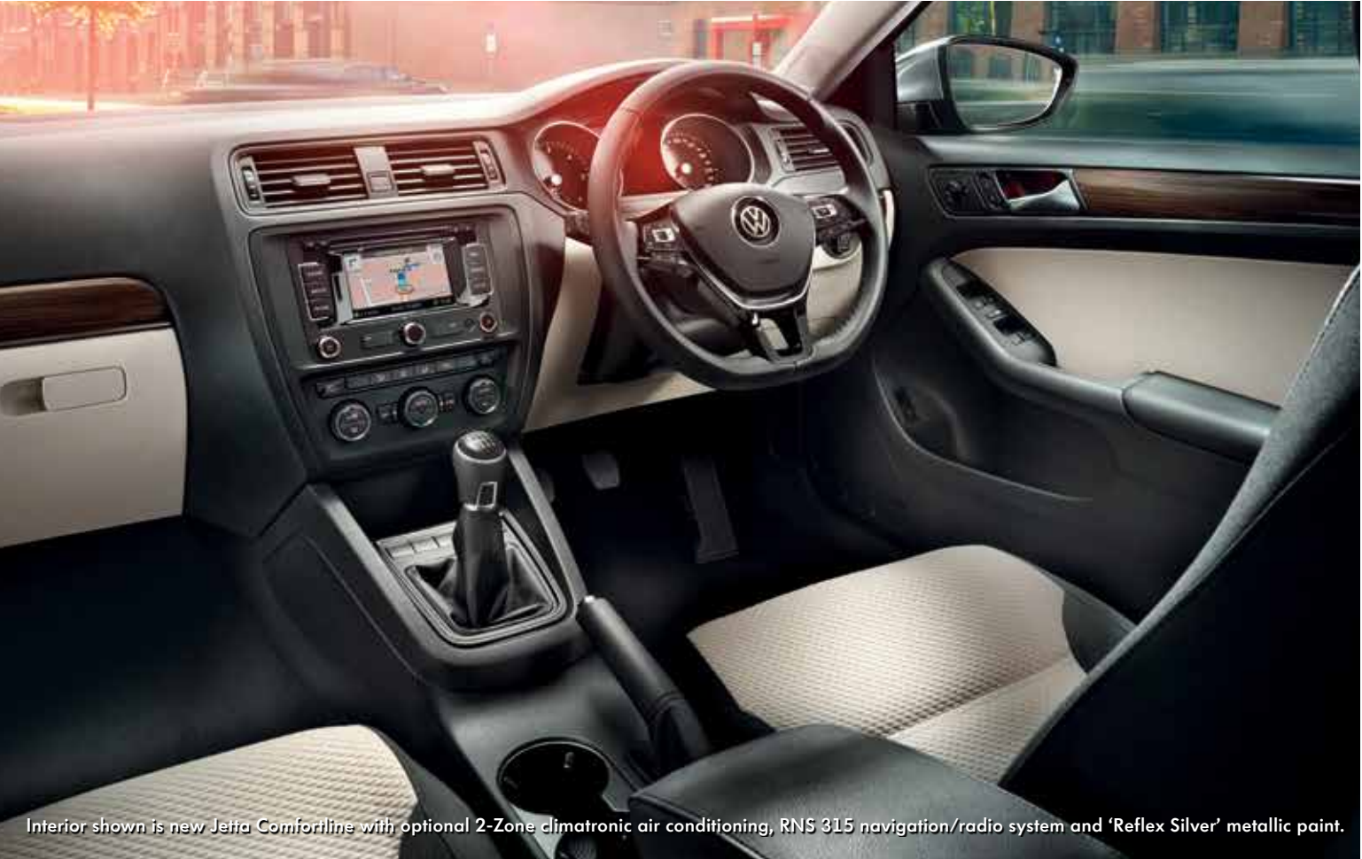
Interior shown is new Jetta Comfortline with optional 2-Zone climatronic air conditioning, RNS 315 navigation/radio system and ‘Reflex Silver’ metallic paint.

Subtle trim elements in the Comfortline provide a touch of elegance and flair with that extra bit of comfort and luxury. With the leather trimmed three-spoke multifunction steering wheel with aluminium decorative inserts providing controls for the RCD 310 radio MP3 player , Bluetooth connectivity for your mobile phone and multifunction display ‘Plus’ as well as cruise control , you can be assured you will arrive at your destination calm and relaxed after every journey. Building over the already well equipped new Trendline, the exterior look of the new Jetta Comfortline is enhanced by the addition of 16 inch ‘Navarra’ alloy wheels and anti-theft wheel bolts, front fog lights with fixed bending light and black radiator grille with chrome mouldings on the fins. While inside, front comfort seats with ‘Sienna’ cloth upholstery including height and lumbar adjustment , ‘Zebrano’ decorative inserts for the dashboard and door trim panel, front centre armrest with storage compartment with two rear air vents , together with a rear centre armrest give both the driver and passengers added comfort. However, the long list of standard equipment doesn’t end there. Choose the new Jetta Comfortline and you will also get load-through provision and a 60:40 split folding rear seat backrest , ideal for transporting long items, storage compartment in the roof console and front seat back storage pockets .