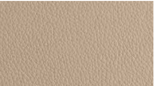
‘Vienna’ leather** Corn Silk Beige YY Optional on Comfortline and Highline models