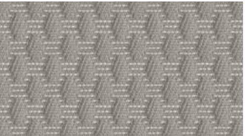
‘Sienna’ cloth Ceramic/Titan Black KB Standard on Comfortline models