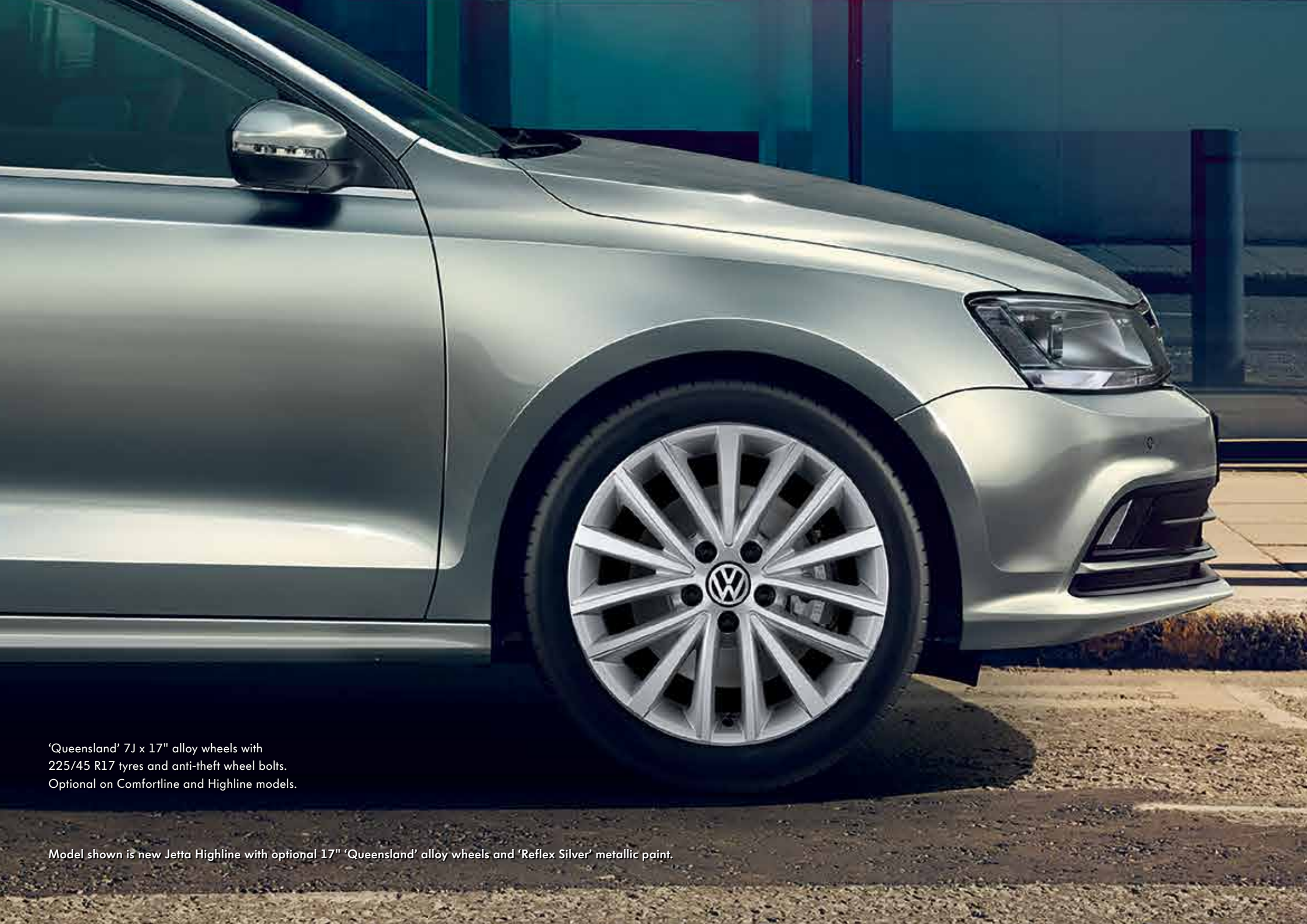
'Queensland' 7J x 17" alloy wheels with 225/45 R17 tyres and anti-theft wheel bolts. Optional on Comfortline and Highline models.