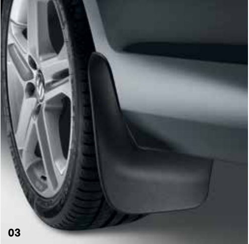
03 Volkswagen Genuine Mudflaps Perfectly shaped to fit your vehicle, these extremely durable mudflaps offer protection against water spray and flying stones. Supplied with fitting kit and instructions. 2 pieces per set. 5C6 075 111 (front) 5C6 075 101 (rear)