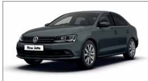
Platinum Grey Metallic* 2R2R