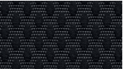
‘Sienna’ cloth Titan Black JM Standard on Comfortline models