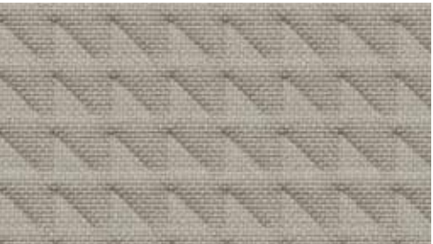
‘Doryc’ cloth Ceramic KB Standard on Trendline models