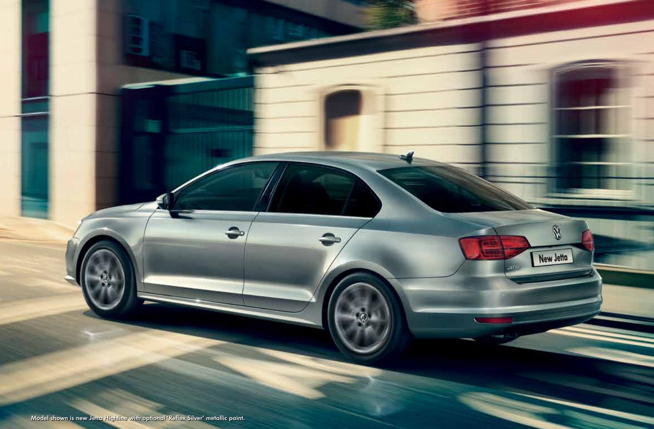
Model shown is new Jetta Highline with optional ‘Reflex Silver’ metallic paint.