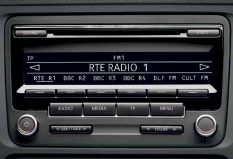
The RCD 310 radio system/MP3 compatible CD player provides excellent acoustics via eight speakers with an output of 4 x 20 watts. It also features a Mobile Device Interface AUX-in socket for connection to an external multimedia source, such as an iPod or MP3 player.