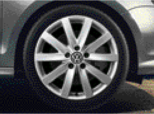
' Porto ' 7J x 17" alloy wheels with 225/45 R17 tyres and anti-theft wheel bolts. Standard on Highline models.