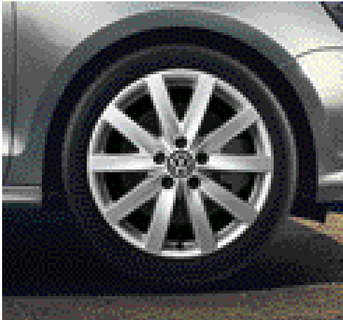
‘Porto’ 6J x 17" alloy wheels with 225/45 R17 tyres and anti-theft wheel bolts and sports suspension give a look of sporty refinement to the Jetta Highline.