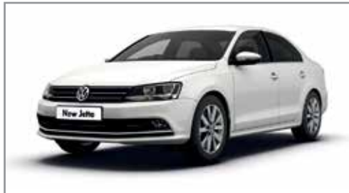
Pure White Non-Metallic 0Q0Q