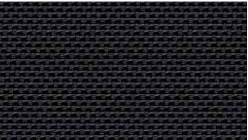
‘Gloss’ cloth Titan Black JM Standard on Highline models