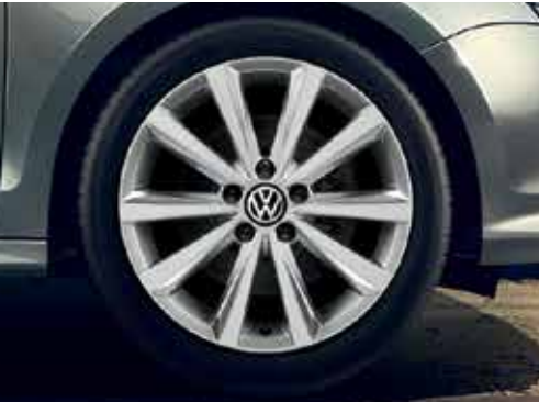
' Salamanca ' 7J x 17" alloy wheels with 225/45 R17 tyres and anti-theft wheel bolts. Optional on Highline models.