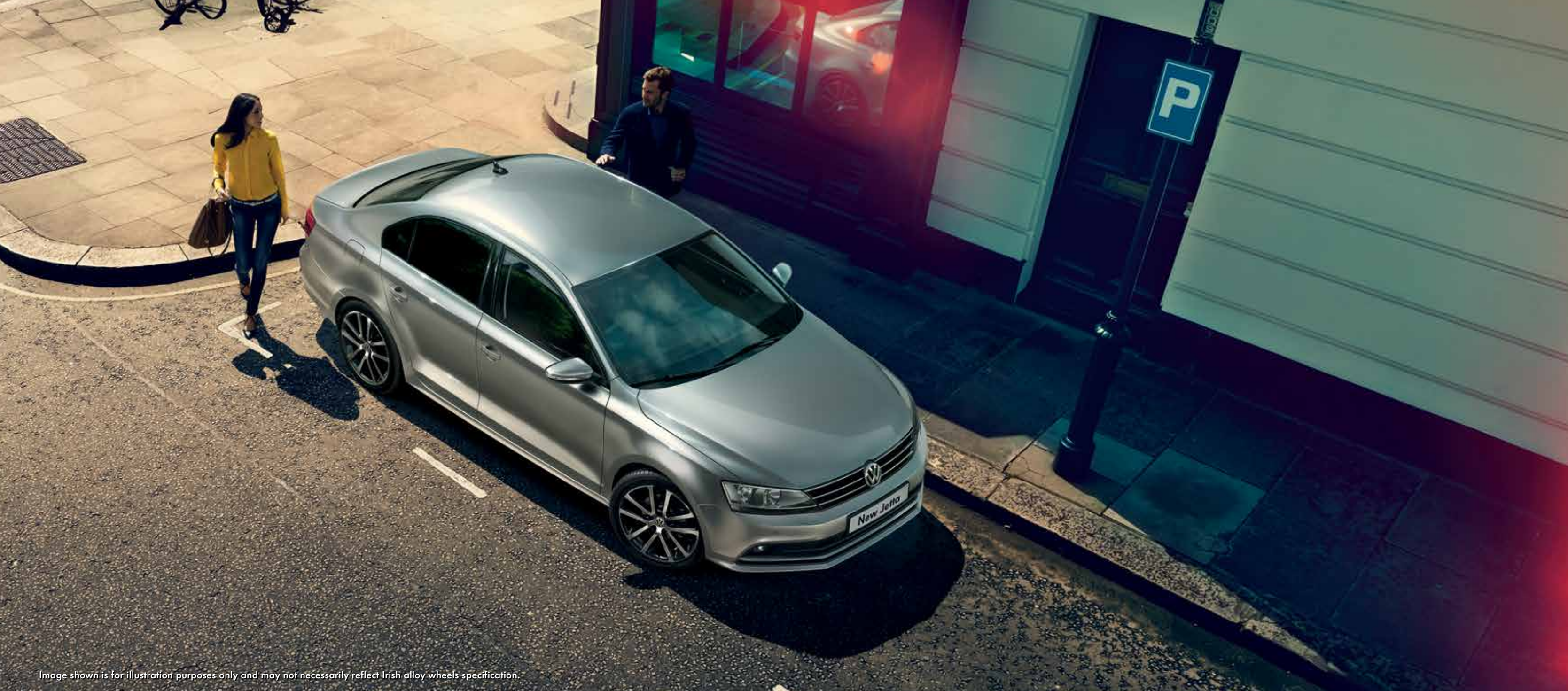
Image shown is for illustration purposes only and may not necessarily reflect Irish alloy wheels specification.