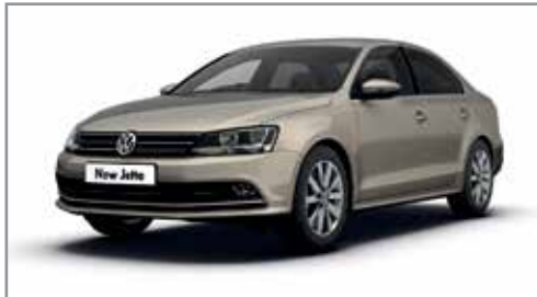
Moon Rock Silver Metallic* 0B0B