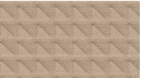
‘Doryc’ cloth Corn Silk Beige JP Standard on Trendline models