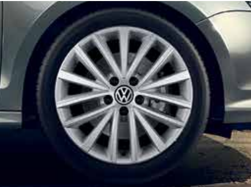
' Queensland ' 7J x 17" alloy wheels with 225/45 R17 tyres and anti-theft wheel bolts. Optional on Comfortline and Highline models.