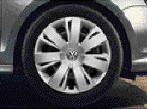
6½J x 16" steel wheels with 205/55 R16 tyres and full size wheel trims. Standard on Trendline models.