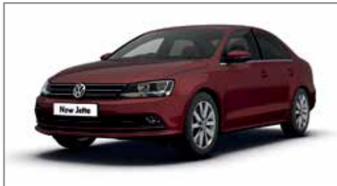
Ruby Red Metallic* 7H7H